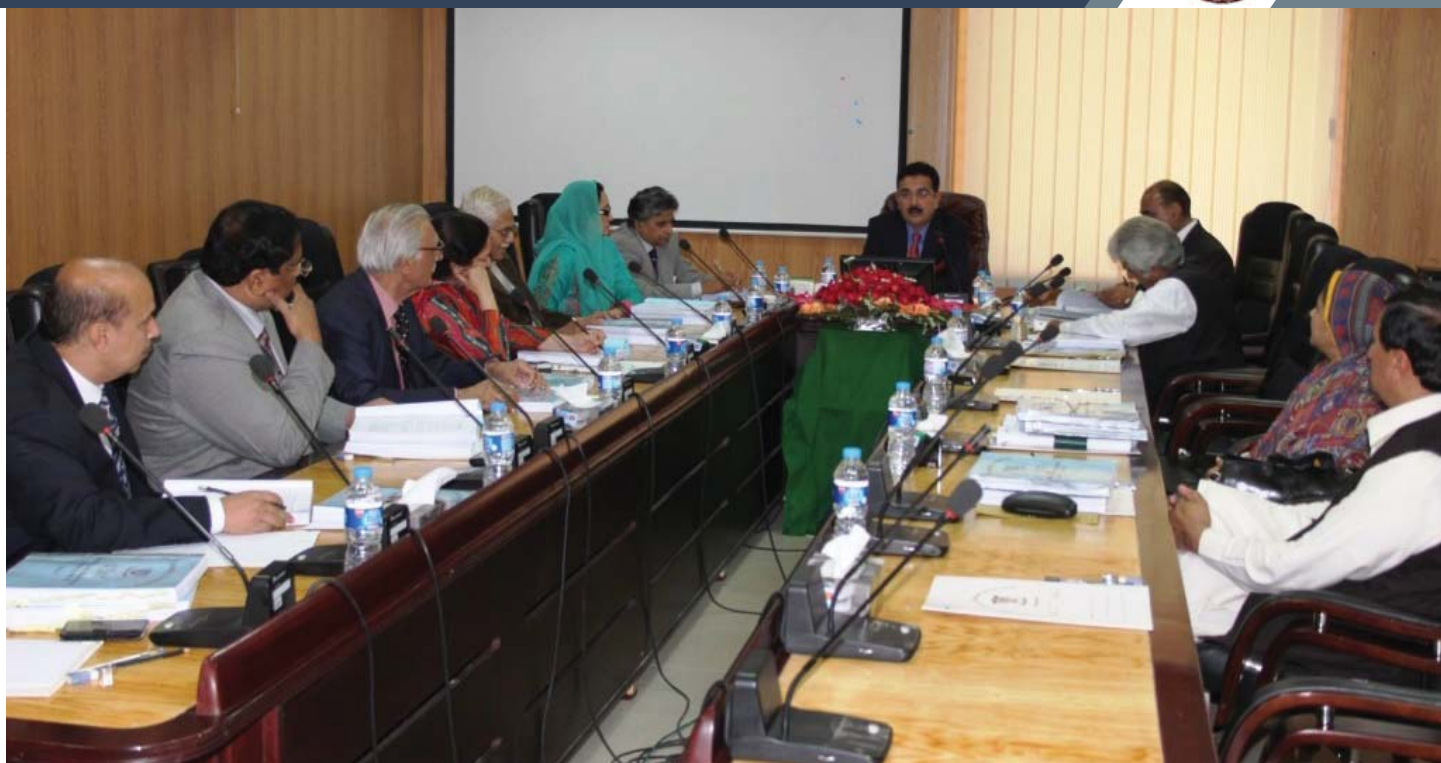
A view of the 43 rd meeting of the Syndicate, Government College University, Faisalabad.