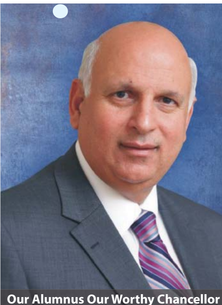
Our Alumnus Our Worthy Chancellor