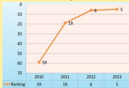
HEC Ranking of GCUF

Government College University Faisalabad